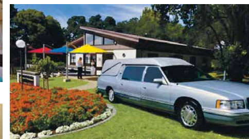
Traditional & Modern Vehicles

Transfer into our care, Eco Preparation, Eco Casket, Hearse Transfer to Funeral, 1 Hour Gathering at any Chapel, Celebrant or Minister Donation, 50 Colour Service Cards, Music, Standard Cremation Fees, Hand tied bouquet of seasonal flowers, 1 Death Certificate