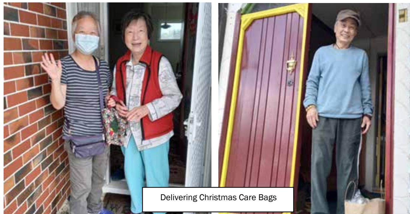
Delivering Christmas Care Bags

people to ask questions or request support via WeChat and for volunteers to offer their assistance. This ensures that older Chinese, Korean or Japanese people needing our help have a way to connect with Age Concern Auckland and request help easily. It also provides translated information about the services and support our team provides.