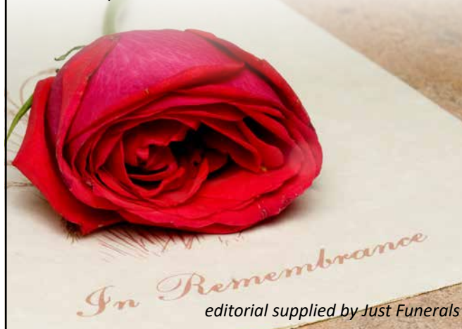
editorial supplied by Just Funerals

As always our funeral home is staffed 9.00am – 5.00pm Monday to Friday, but due to the ongoing spread of Winter colds etc, we ask that you phone ahead to make an appointment to see us in person.