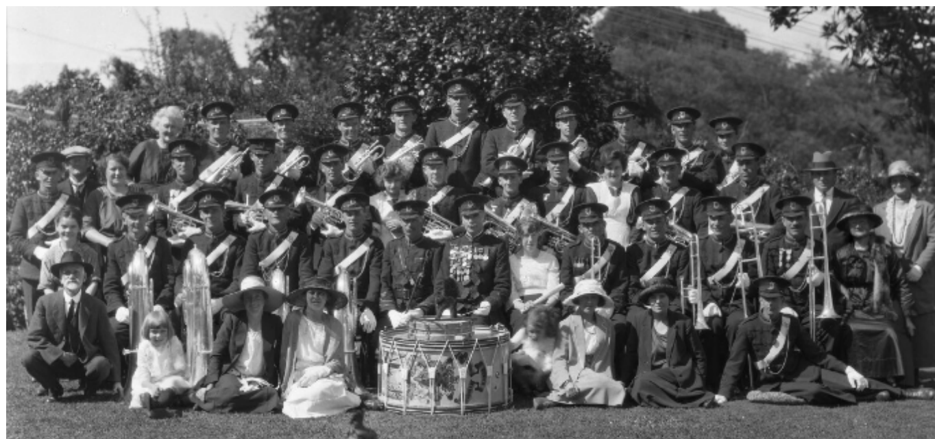
Whanganui Brass Band circa 1930

https://www.heritage.org.nz/news-and-events/this-month-in-history