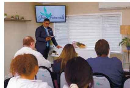
Onsite 35 Seat Chapel

Transfer into our care, Temporary Preparation, Eco Casket, Hearse Transfer to Funeral, Hand tied bouquet of seasonal flowers, Preferred Crematorium Cremation Fees, 1 Death Certificate