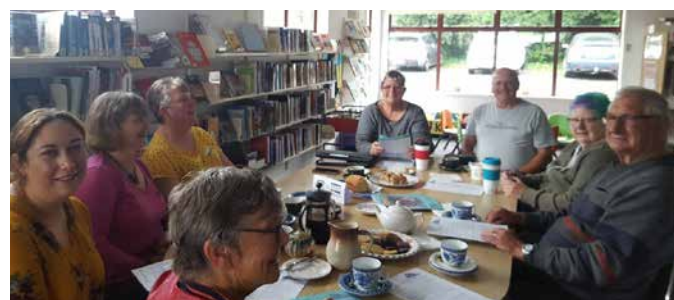
The Friendly group at Waverley Library.