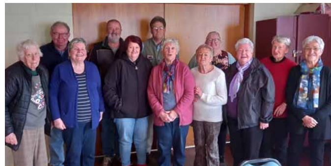
The friendly Thursday morning coffee group in Hawera.