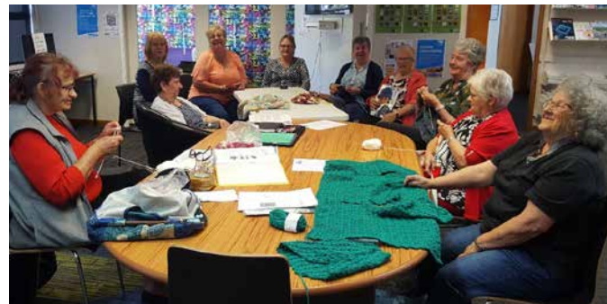
The Fund Friendly Knitters in Patea Library

Please join us to make or meet with friends, socialise relax and sing the Friday away.