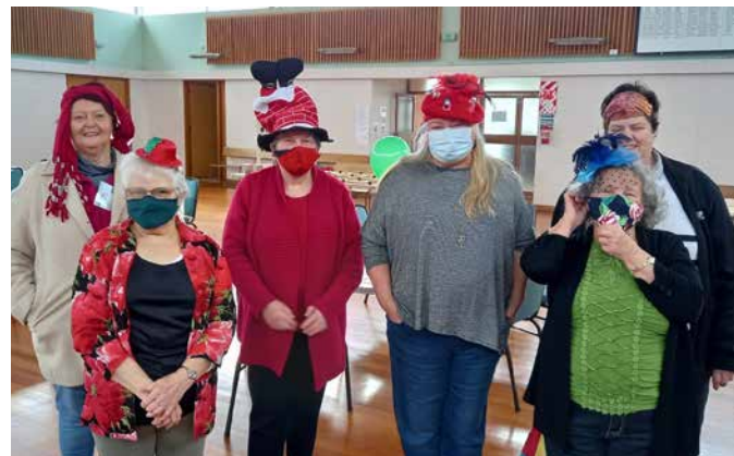
Early arrivals at the Hawera Mad Hatters Tea Party.