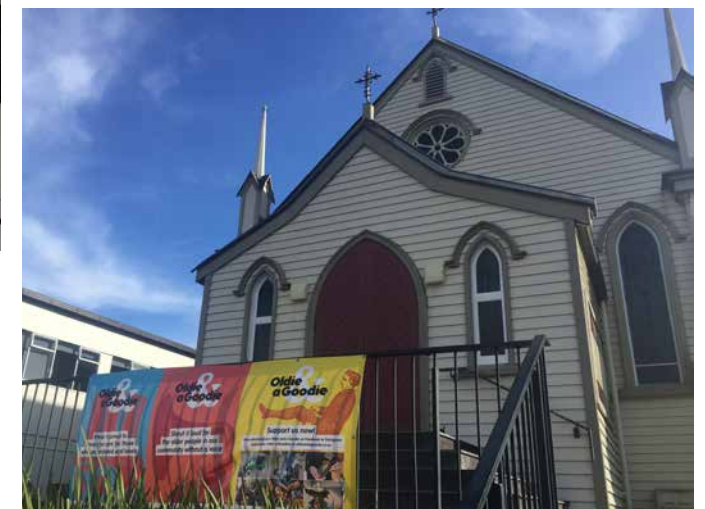
Mt Eden Village Community Centre:

Our heartfelt thanks to all the people who supported us with a donation, your help makes an immense difference.