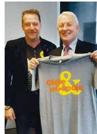
Mayor Phil Goff