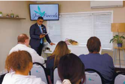
Onsite 35 Seat Chapel

Transfer into our care, Temporary Preparation, Eco Casket, Hearse Transfer to Funeral, Hand tied bouquet of seasonal flowers, Preferred Crematorium Cremation Fees, 1 Death Certificate