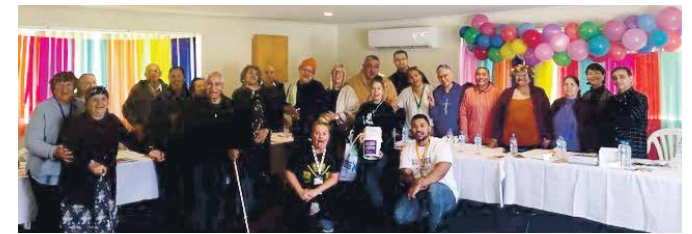
Kainga Ora – Castlefinn Village: