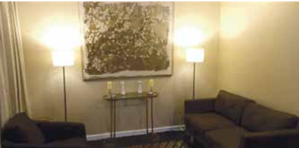
Comfortable Arrangement Room