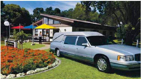
Traditional & Modern Vehicles

Transfer into our care, Eco Preparation or Embalming, Eco Casket, Hearse Transfer to Funeral, 1 Hour Gathering at any Chapel, Celebrant or Minister Donation, 30 Colour Service Cards, Music, Standard Cremation Fees, Hand tied bouquet of seasonal flowers, Preferred Crematorium Cremation Fees, 1 Death Certificate