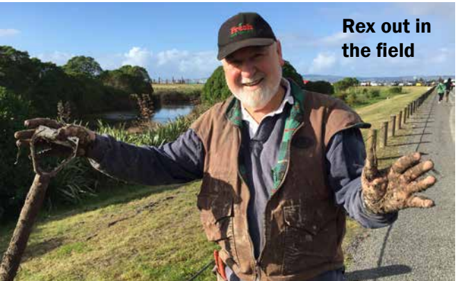
Rex out in the field

We have rapidly increased the scale and pace of our work to fix our legacy of environmental issues, and confront a changing climate – yet we can’t do this alone. We need to do so much more as a region to achieve the transformational change required to fix our environmental footprint. So let’s act now, change some of our habits to be more sustainable, and protect the future for the next generations.