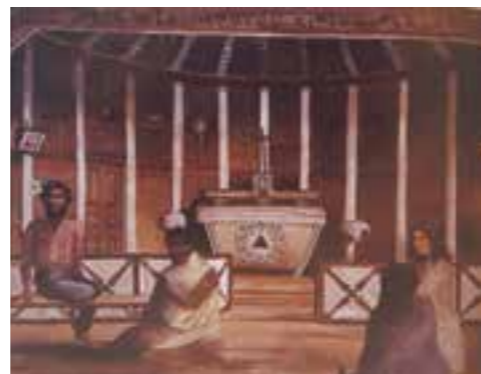
A painting of the inside of the Catholic Church.