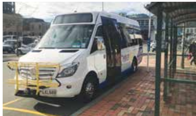
Editorial supplied by Nelson City Council

For more information visit www.nbus.co.nz